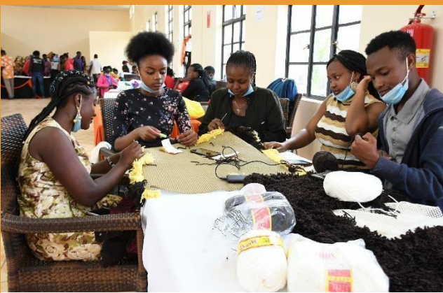
Picture 2 Students learning the art of mat knitting at Mua Art Fest held on 12th of February at Kisaju.