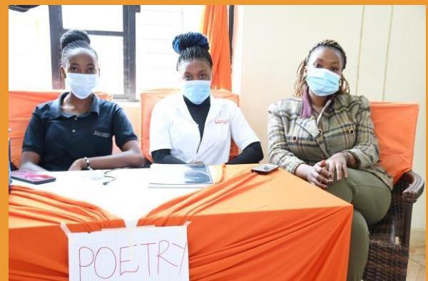
spotlight 3 The Poetry team all set and ready to perform