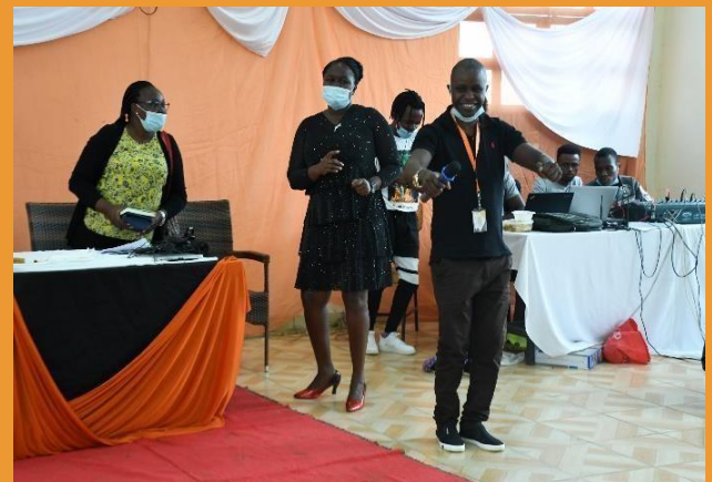
Spotlight 2; 'Dance is the vertical expression of a horizontal desire, made legal by music.'