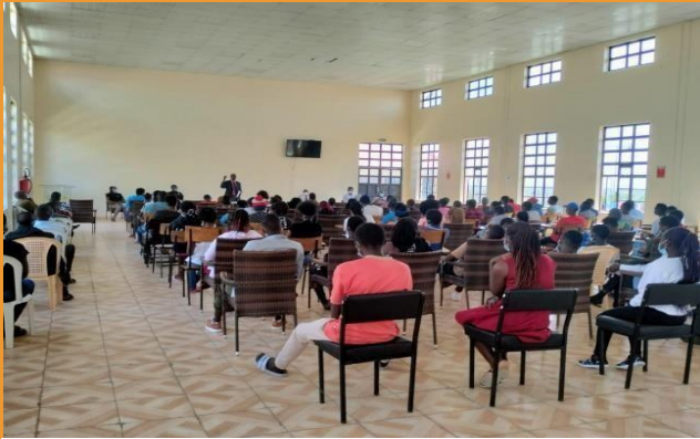
Picture 1 The VC Prof. Okeyo addressing students at Kisaju Main Campus during their orientation.