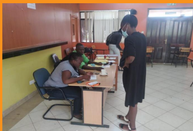
Students voting during the student council elections at South C campus