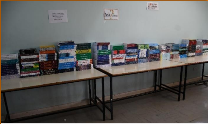
PICTURE 2: Books purchased by the university in core business subjects taught in the university.