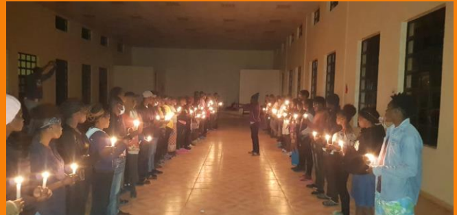
PICTURE 8; Kisaju students holding a candle lighting session for their departed souls comrades.